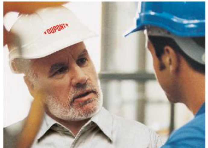
A Specialist is available to assist you throughout your DuPont™ Tyvek® installation.

The DuPont Building Knowledge Center is where DuPont building scientists and construction professionals can evaluate solutions and collaborate on new ideas that will assist you in building structures that are more energy efficient and durable. The DuPont™ Building Knowledge Center is a part of a long history at DuPont of scientific discovery and application knowledge that has changed the way people live, work